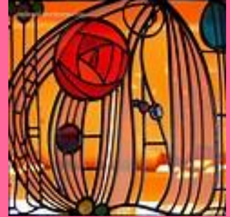
Stained glass windows